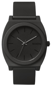
A119 THE TIME TELLER P Matte Black A119-524 $60.00 USD