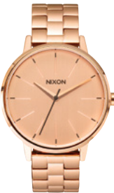
A099 THE KENSINGTON All Rose Gold A099-897 $175.00 USD