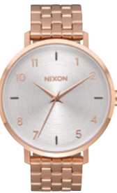
A1090 THE ARROW All Rose Gold / White A1090-2640 $200.00 USD