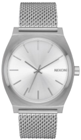
A1187 THE TIME TELLER MILANESE All Silver A1187-1920 $125.00 USD