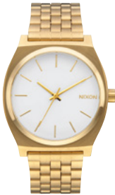
A045 THE TIME TELLER Gold / White A045-508 $100.00 USD