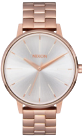
A099 THE KENSINGTON Rose Gold / White A099-1045 $175.00 USD