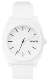
A119 THE TIME TELLER P Matte White A119-1030 $60.00 USD