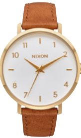
A1091 THE ARROW LEATHER Gold / White / Saddle A1091-2621 $150.00 USD