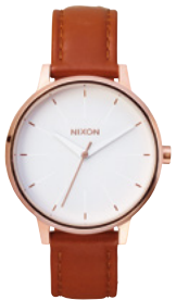
A108 THE KENSINGTON LEATHER Rose Gold / White A108-1045 $125.00 USD