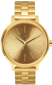
A099 THE KENSINGTON All Gold A099-502 $175.00 USD