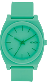
A119 THE TIME TELLER P Matte Spearmint A119-2288 $60.00 USD