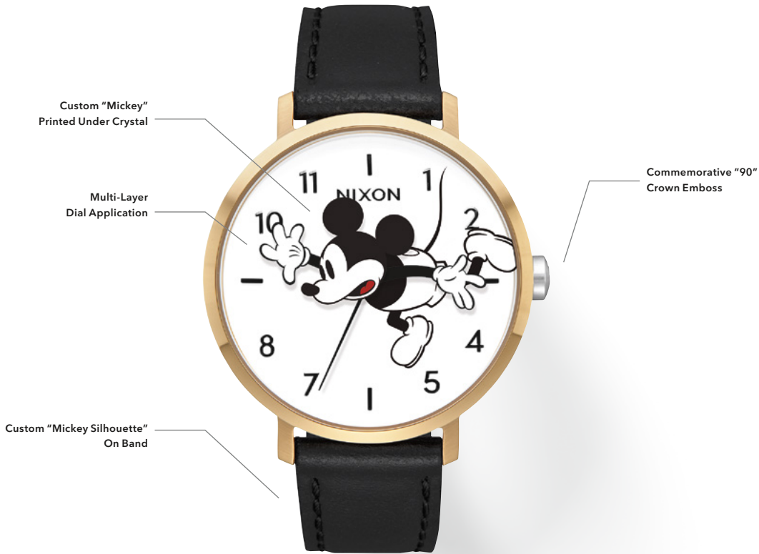
Gold / Black / Mickey 3095 $175.00 USD