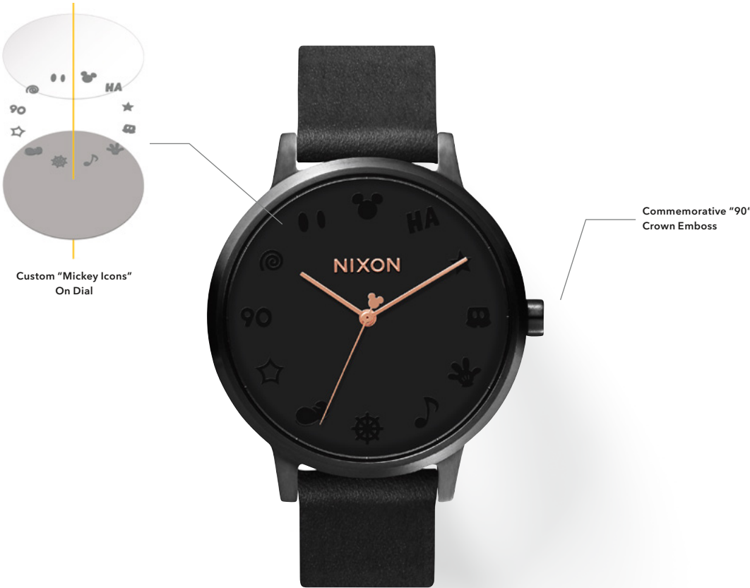
All Black / Rose Gold / Mickey 3096 $150.00 USD