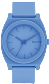
A119 THE TIME TELLER P Matte Periwinkle A119-2286 $60.00 USD