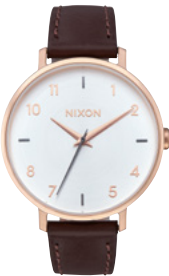
A1091 THE ARROW LEATHER Rose Gold / Silver A1091-2369 $150.00 USD