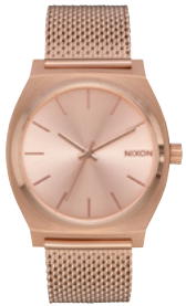
A1187 THE TIME TELLER MILANESE All Rose Gold A1187-897 $125.00 USD