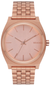
A045 THE TIME TELLER All Rose Gold A045-897 $100.00 USD